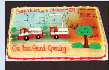
Fire Station #89